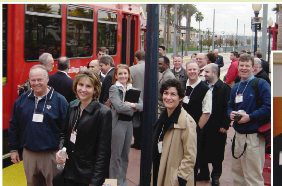
2005 Leadership Briefing and Tour