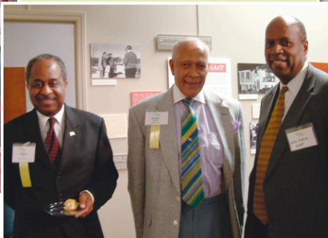
Regional Elected Officials Transportation Reception