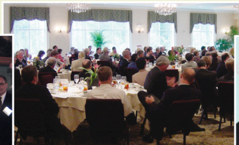
4th Annual Meeting